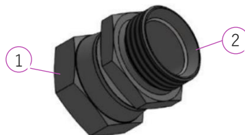
Discharge hose adaptor for DN33 valve